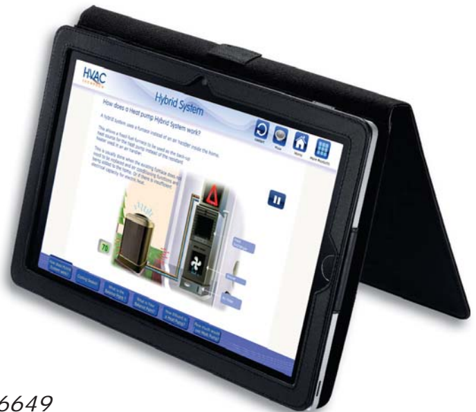
ASUS Eee Slate with Hybrid System Application

"Since I have been using the Ideal Home Comfort Showroom made by Opportunity Interactive, my sales have risen to a whole new level. I am closing more high end, high profit job than ever!"